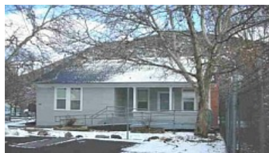
Siskiyou County Genealogical Society